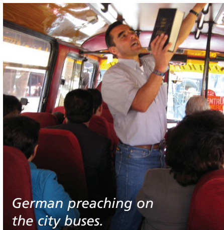
German preaching on the city buses.

We preached in the busses about calling the bad, bad and the good, good. This refers to the words of the President of Venezuela, who said we should no longer call guerrillas terror-